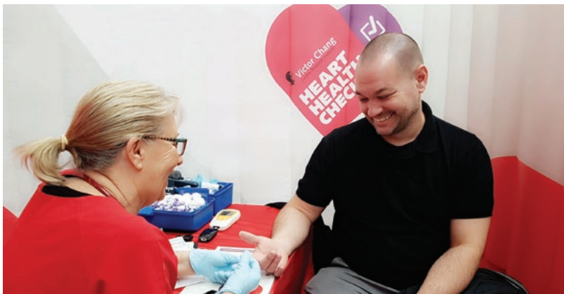
One of our nurses conducting a heart health test in Sydney's south west

The tour was kindly supported by a generous donation of $150,000 from the IMB Bank Community Foundation.