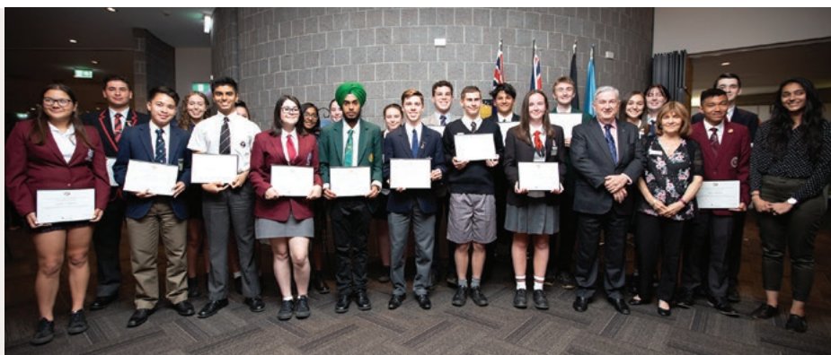
Some deserving recipients of the Victor Chang Cardiac Research Institute's School Science Awards 2019

The award has been developed to foster and encourage an interest in science among secondary school students. The awards are based on a firm belief that for Australia to be at the forefront of innovation and medical