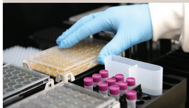
This sophisticated machine analyses heart cells and uses electrical signals to create heart beats, enabling tests to be done