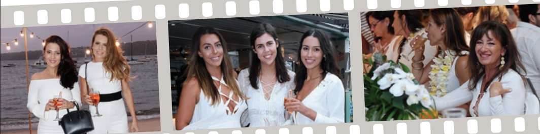
Supporters enjoying the 2017 Bay Soiree, which was hosted by Todd McKenney.

Tickets are selling fast and places are limited so buy your tickets now at www.victorchang.edu.au/bay-soiree and be part of this very special evening.